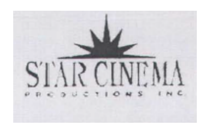
Applicant STAR mark

A mere examination and comparison of the competing labels reveal that the dominant word STAR appears in both marks. Although the records disclose that apart from the use of the word STAR, there are features composing Applicant's STAR mark which included the use of a device consisting of the image of the rays of a rising sun above the words STAR CINEMA PRODUCTIONS, INC. Underneath the rising sun design comprising Applicant's STAR mark is written the dominant word STAR along with the word CINEMA. Unlike the word STAR, the other words, CINEMA and PRODUCTIONS, INC. are descriptive of the service/s Respondent is offering to the public. STAR as word in Opposer as well as Respondent's label is arbitrary, and as word mark it is not generic and may be appropriated by anybody as its own when used on goods/services not descriptive of the label or mark, by way of illustration, we take the word "APPLE" which is a very distinctive trademark for a computer. The following popularly known marks demonstrate how marks are declared fanciful and arbitrary, for being non-descriptive of the article to which it pertained: